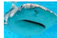
Sharks Everywhere: Vote for Your Favorite

Hi Temperature Tube & Box furnaces programable up to 1700C at low cos www.mtixtl.com