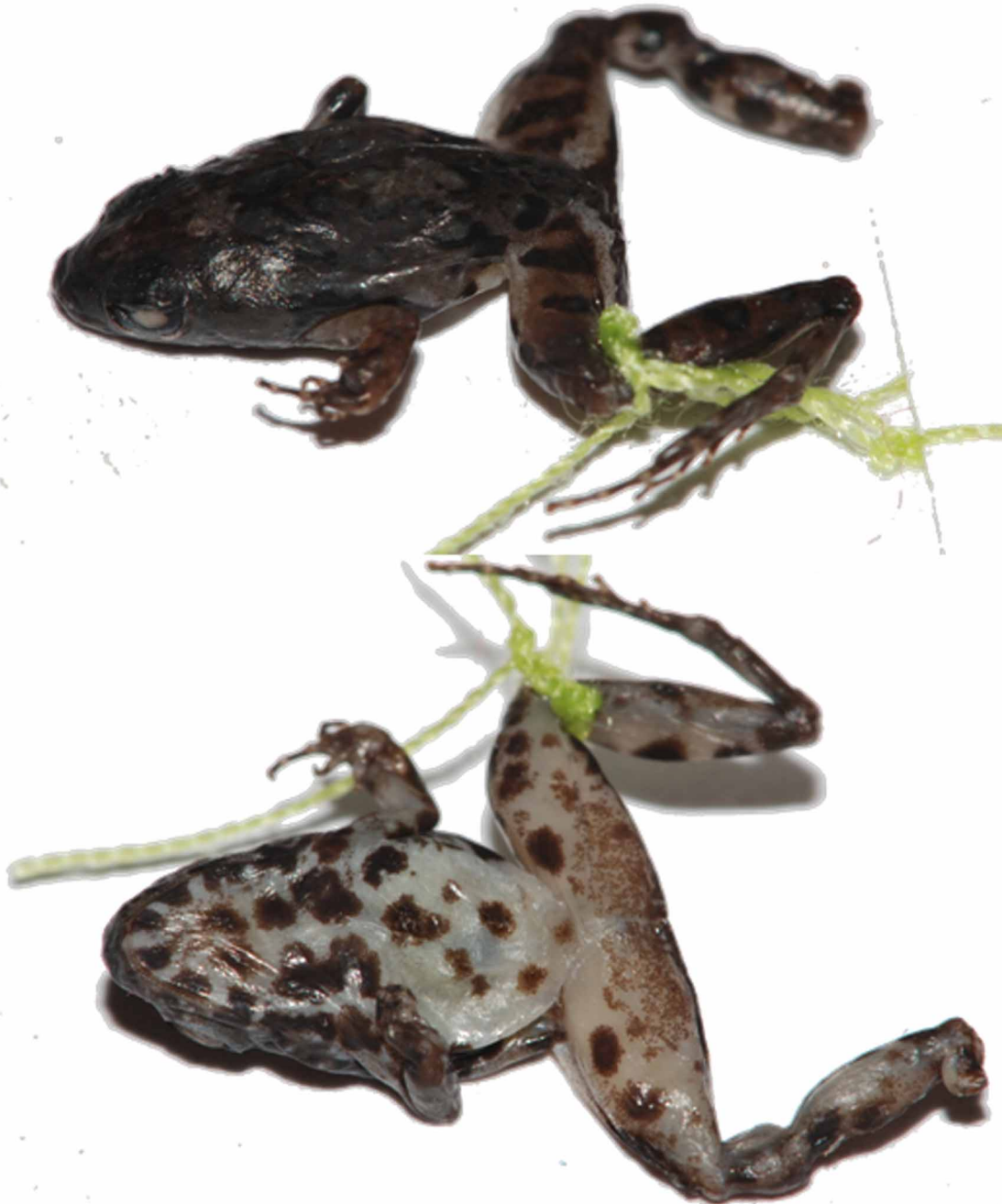
FIGURE 1. Dorsolateral and ventral view of Phrynobatrachus pintoii sp. nov. (ZMB 70689, holotype).

Small, compact Phrynobatrachus , characterized by combination of warty back; warty eyelids (eyelid cornicle absent); large dark spots on white throat, breast and belly; rudimentary webbing.